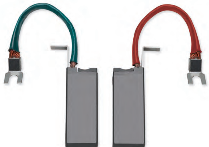
Ground Brush #W61048890AZ