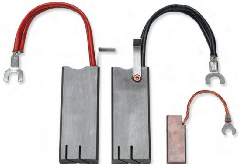
Power Brush #W61049721