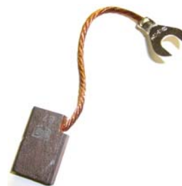
Ground Brush #W61044844