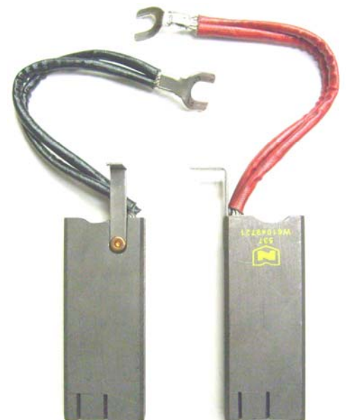
Power Brushes #W61048967 #W61049721

For this Generator Morgan AM&T also offers: